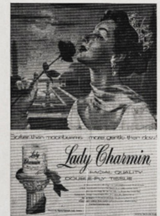
Before the "squeeze" and purchase by Procter & Gamble, Charmin Paper Mills ran space like this 1956 newspaper ad for a two-ply version of Charmin, dubbed Lady Charmin. The ads did well, but nothing like P&G's "Please don't squeeze" tv campaign that followed.

What happened in '64 to the present? Have attitudes changed, or have people? Initially only a few vicious letters went through the Cincinnati Post Office. One I still have, and enjoy reading from time to time, was from a Valparaiso University professor who objected to folks squeezing the Charmin