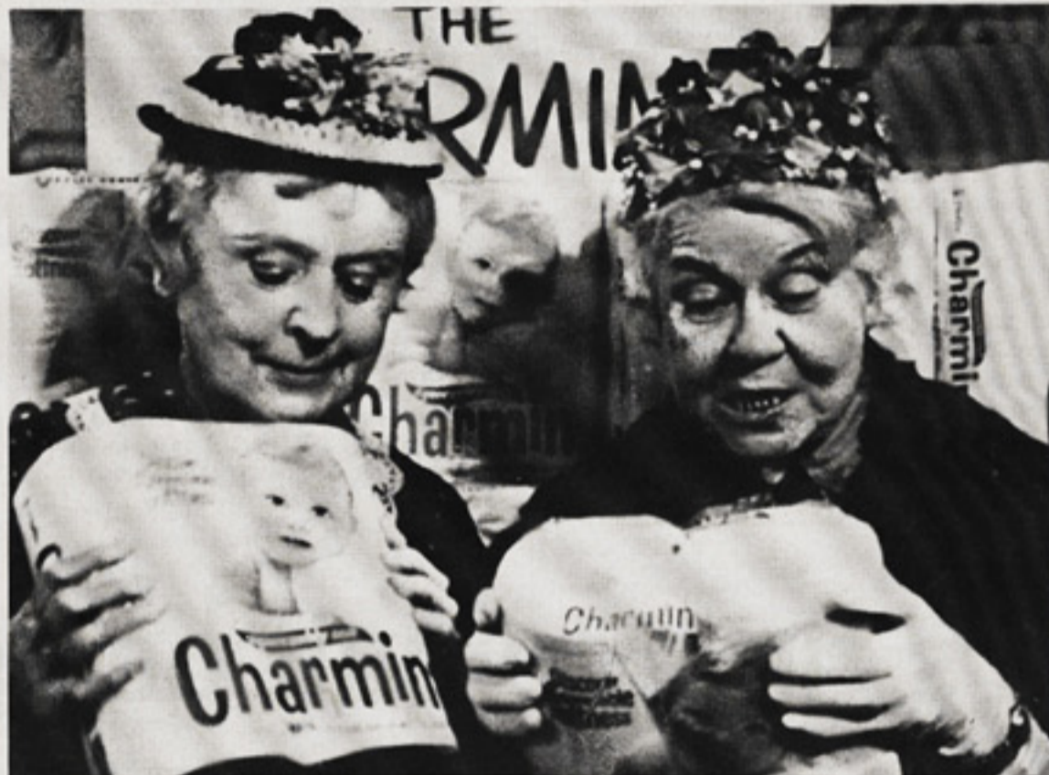
Like squeezing melons, squeeze "soft" Charmin? Grocers would flip. So tell 'em DON'T.

It happened this way. The Charmin Paper Co. was a Green Bay mill that Procter & Gamble bought