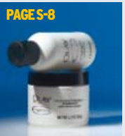
PAGES-8 Olay Regenerist Leigh Radford