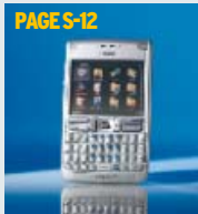
PAGE S-12 Cingular Marc Lefar