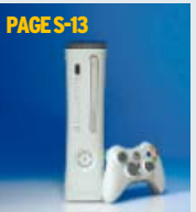
PAGES-13 Xbox 360 Peter Moore