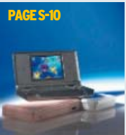
PAGES-10 DS Lite George Harrison