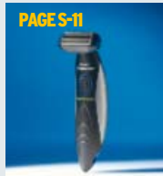
PAGE S-11 Bodygroom Bob Baird