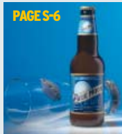
PAGES-6 Blue Moon Lee Dolan